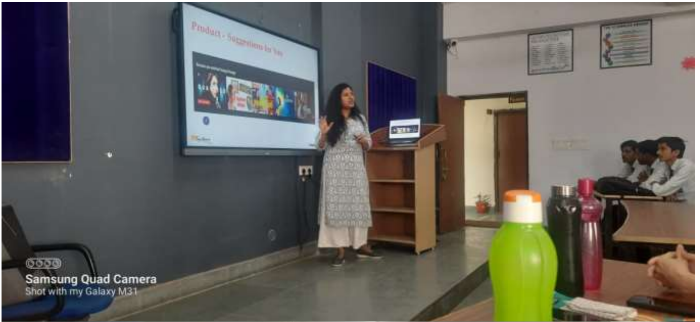
Samsung Quad Camera Shot with my Galaxy M31