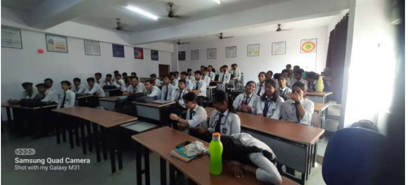
Samsung Quad Camera Shot with my Galaxy M31